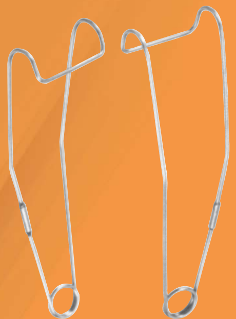
Jaffe Lid Retractor K-552 9 mm wide Blade, 5.3 cm