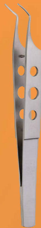
Colibri Forceps K-510 1 x 2 (0.12)