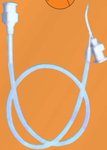
Simcoe A/I 0.33 Port K-559