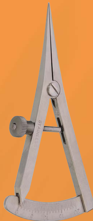
Caliper 20mm K-548