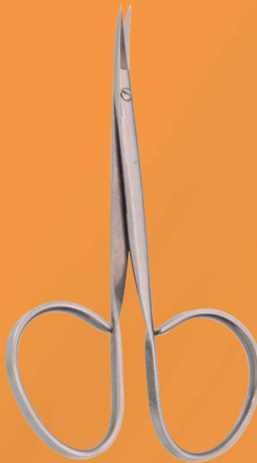
Tenotomy Scissors K-522 9.5cm Straight K-523 9.5cm Curved Sharp/Sharp