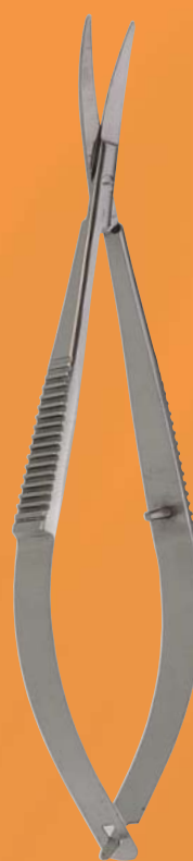
Iris Scissors K-534