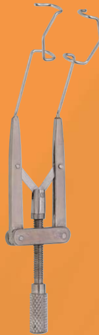
Lieberman Speculum K-560