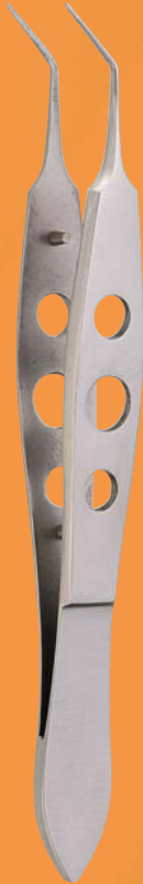
McPherson Forceps K-505 9.0 cm K-506 11.0 cm