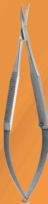
Castroviejo Corneal Section Scissors Miniature, Slight Curve With Stop, K-529 10.8cm