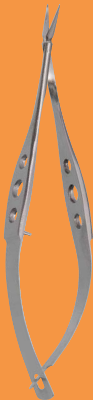
Cephalotomy Scissors K-531