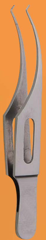
Holding & Folding Lenses for Acrylic K-511