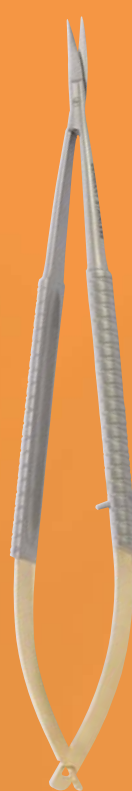
Micro Dissecting Scissors K-535