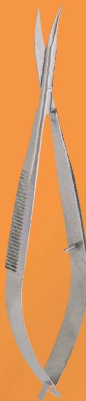
Westcott Scissors K-533