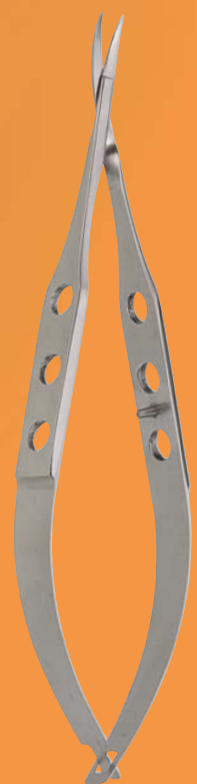
Corneal Scissors K-530 12.3 cm