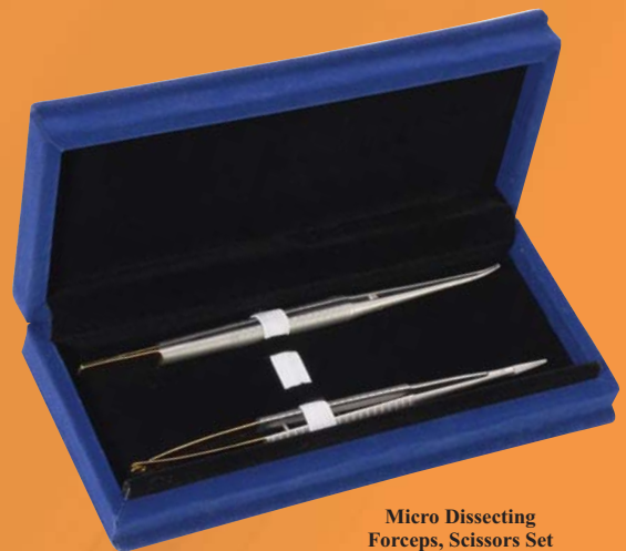
Micro Dissecting Forceps, Scissors Set K-564