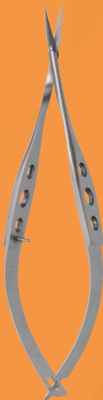
Vannas Scissors K-532