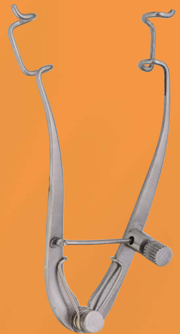
Clark Speculum K-561