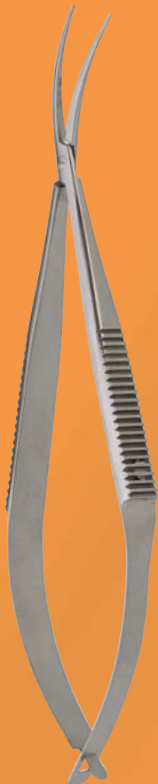
IOL Holding Forceps K-526 11.5 cm