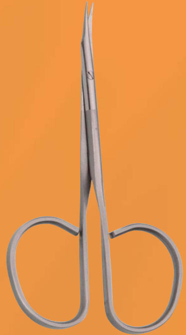
Tenotomy Scissors K-524 9.5cm Straight K-525 9.5cm Curved Blunt/Blunt