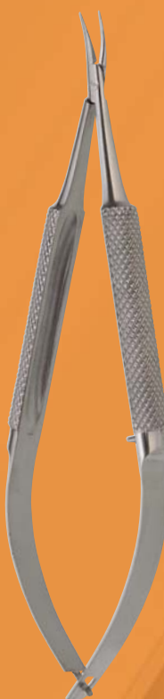
Micro Needle Holder K-528 11.5 cm