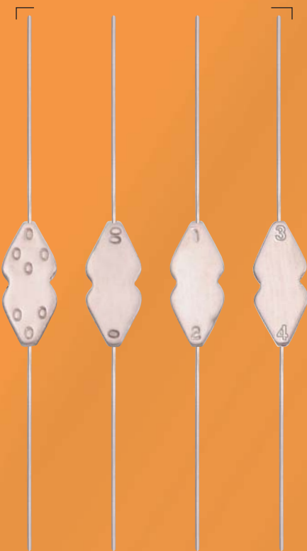
Lachrymal Probes K-550