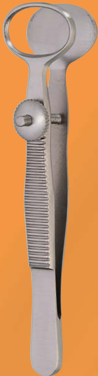
Desmarres Chalazion Forceps K-512 22 mm Inside Diameter 8.9 cm