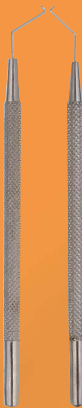
Nagahara Chopper K-546