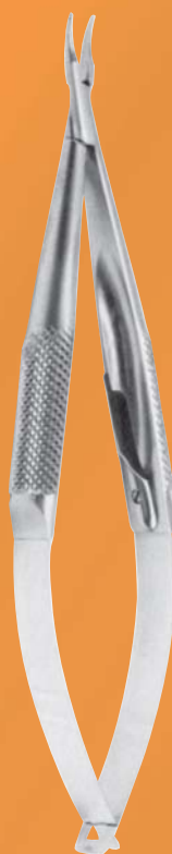
Barraquer Needle Holder Standard, Curved, with Lock K-527 12.3 cm